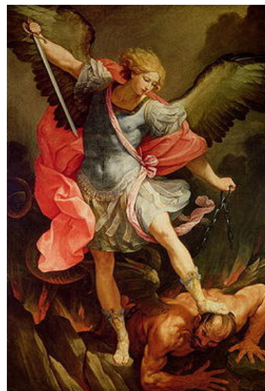
Michael the Archangel, Guido Reni, Santa Maria della Concezione, 1636

Holy Michael, Archangel, defend us in the day of battle; be our safeguard against the wickedness and snares of the devil. May God rebuke him, we humbly pray: and do thou, O Prince of the heavenly host, by the power of God, thrust down to hell Satan and all wicked spirits who wander through the world for the ruin of souls. Amen.