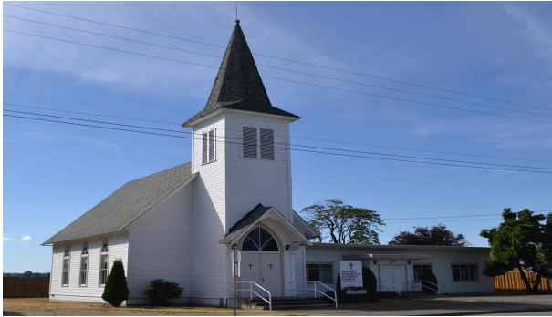
Historic Lutheran Church in Abbotsford (Matsqui) where the Parish of St. Michael and All Angels worship

Parish of Saint Peter and Saint Paul Burnaby, British Columbia and Parish of Saint Michael and All Angels Abbotsford, British Columbia