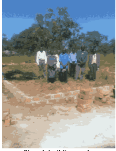
Church building under construction in Chisamba Parish, Zambia

continuing to build new churches, repair and maintain older ones, while supplying clergy with the sacramental necessities.