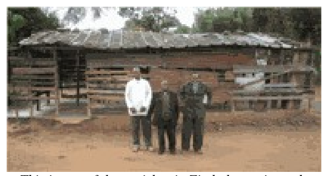
This is one of the parishes in Zimbabwe – it needs serious attention, but the people come joyfully and faithfully to worship Our Lord Jesus Christ despite their poverty.

Southern Africa is very poor with large numbers of unemployed (about 45% of the population) and many refugees from neighboring states who have poured into South Africa. Political turmoil and bad governance in neighboring countries has created a huge problem of poverty and many people live well below the breadline in sprawling shack communities on the edges of the cities. HIV and AIDS are rampant amongst these communities.