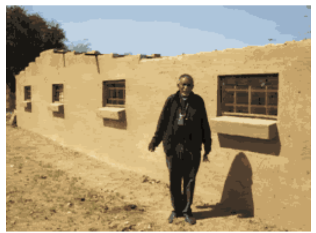
The rebuilt St. Matthew's Parish