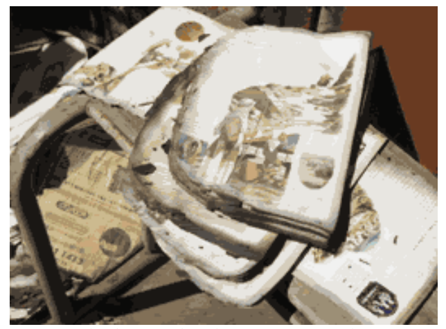
Books destroyed in the fire at St. Matthew's