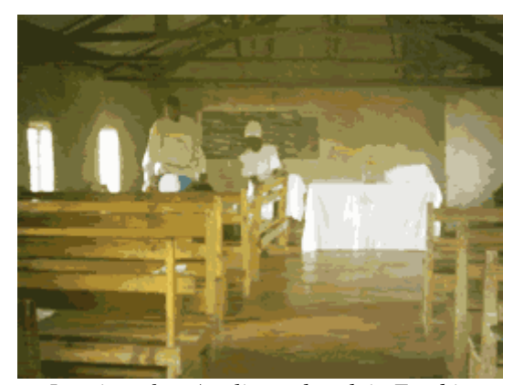
Interior of an Anglican church in Zambia

continuing to build new churches, repair and maintain older ones, while supplying clergy with the sacramental necessities.