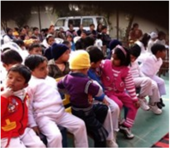
Village children celebrate a Christmas cultural program in India