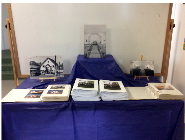
History displays at the Cathedral Church on October 1 st , 2017