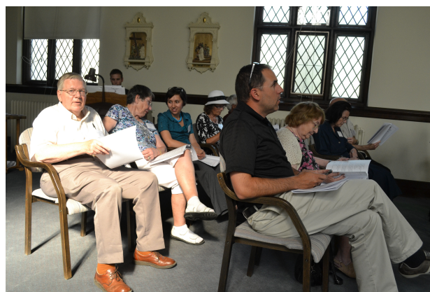
Delegates participating in Evensong