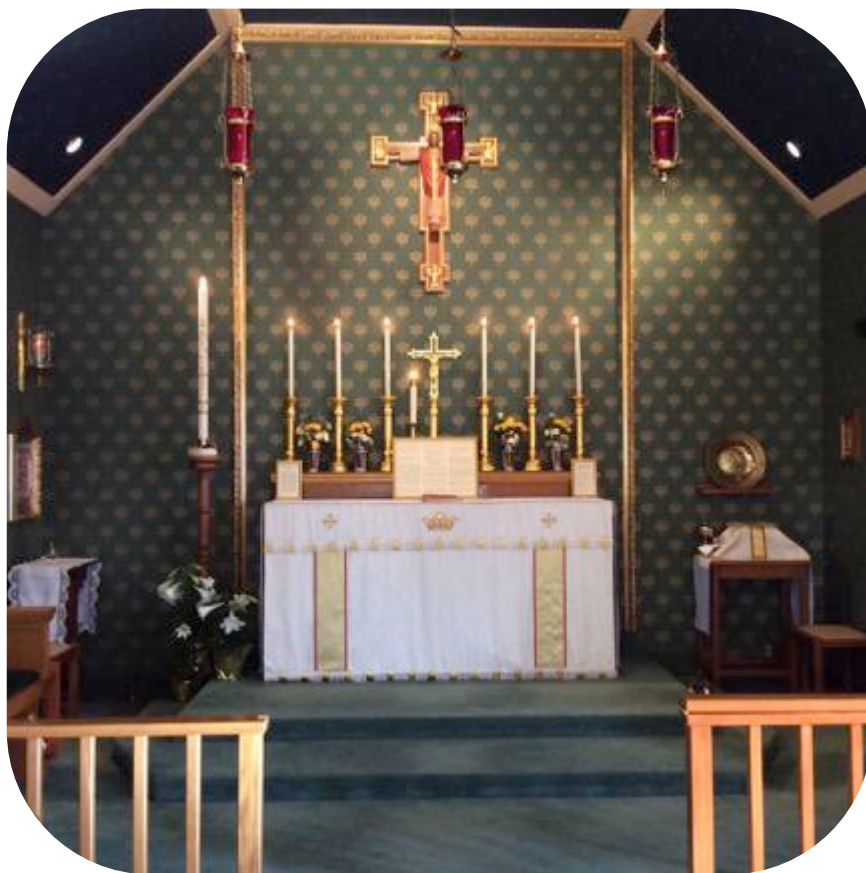
Easter 2018 at the Cathedral

The Clergy and Laity of the Cathedral Church continue to support with their time, talent, and treasure the Anglican Catholic Church of Canada, the Traditional Anglican Communion, and the International Anglican Fellowship. We may be small in number but we are big in faith, fellowship and Christian service. May God continue to bless His Church in this Cathedral Parish with strong, faithful, and devoted clergy and people -- and by His grace may each of us continue to grow in the knowledge and love of God, and of His Son, Jesus Christ our Lord. Amen.